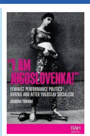
"I Am Jugoslovenka!" Feminist Performance Politics During & After Yugoslav Socialism

Tuesday, March 8, 2022 12:00 PM | Via Zoom